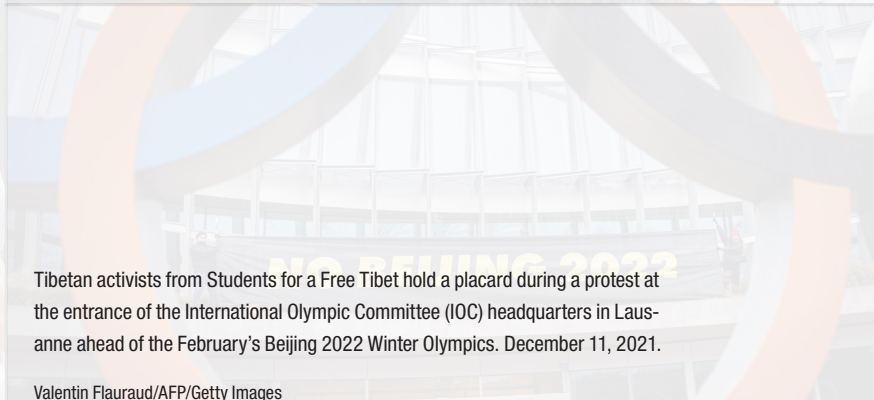
Tibetan activists from Students for a Free Tibet hold a placard during a protest at the entrance of the International Olympic Committee (IOC) headquarters in Lausanne ahead of the February's Beijing 2022 Winter Olympics. December 11, 2021.