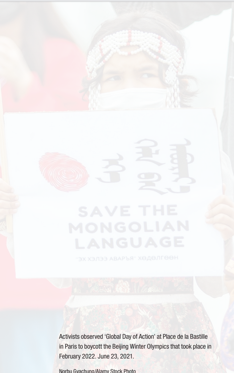
Activists observed 'Global Day of Action' at Place de la Bastille in Paris to boycott the Beijing Winter Olympics that took place in February 2022. June 23, 2021.