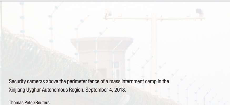
Security cameras above the perimeter fence of a mass internment camp in the Xinjiang Uyghur Autonomous Region. September 4, 2018.